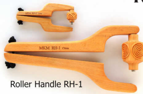
Roller Handle RH-1

RH2 • $10.95 (handle fits MRS s , MRX s )