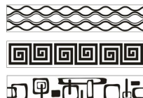
ARMD - set D